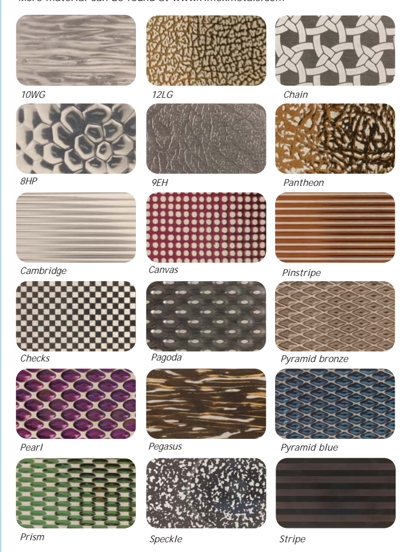
All patterns and textures are available in all colours shown.

More material can be found at www.rimexmetals.com